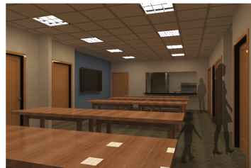
COMMUNITY CLASSROOM AND KITCHEN