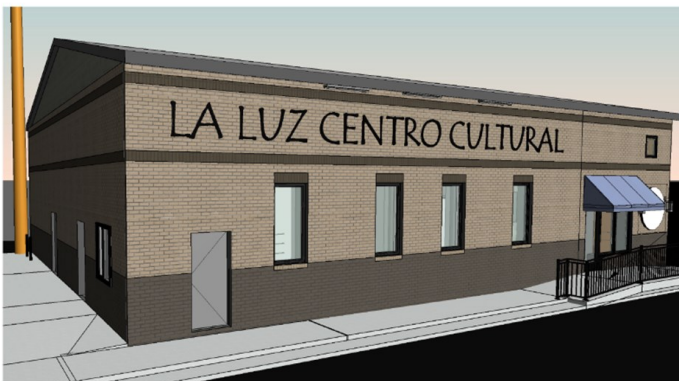
2 FACADE CONCEPT - VIEW 2