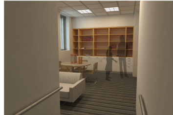
FAMILY ROOM GAME SHELF AND TABLE